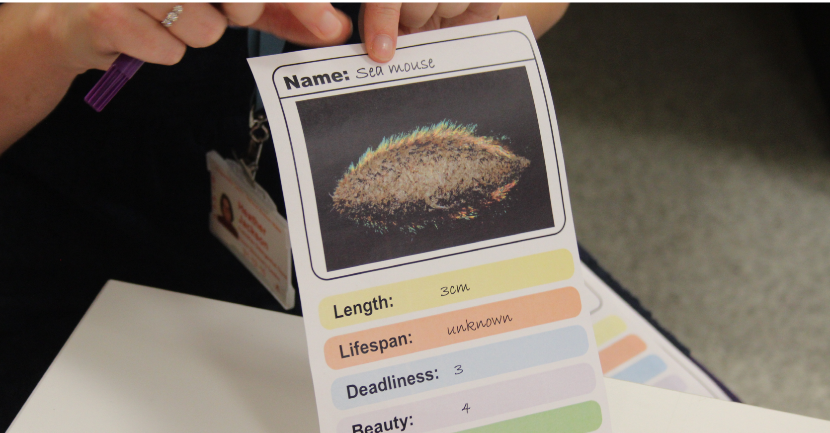
Testing draft worm 'top trumps'!

Our next projects feature a small-scale redevelopment of a natural history display about fungi and vegetation, and a dinosaur temporary exhibition, both involving young people in co-curating the displays. We want to test some of the questions that have arisen through our projects to date. We'd like to explore the benefits of working with young people to co-curate displays, and find a common set of approaches to apply to future re-displays.