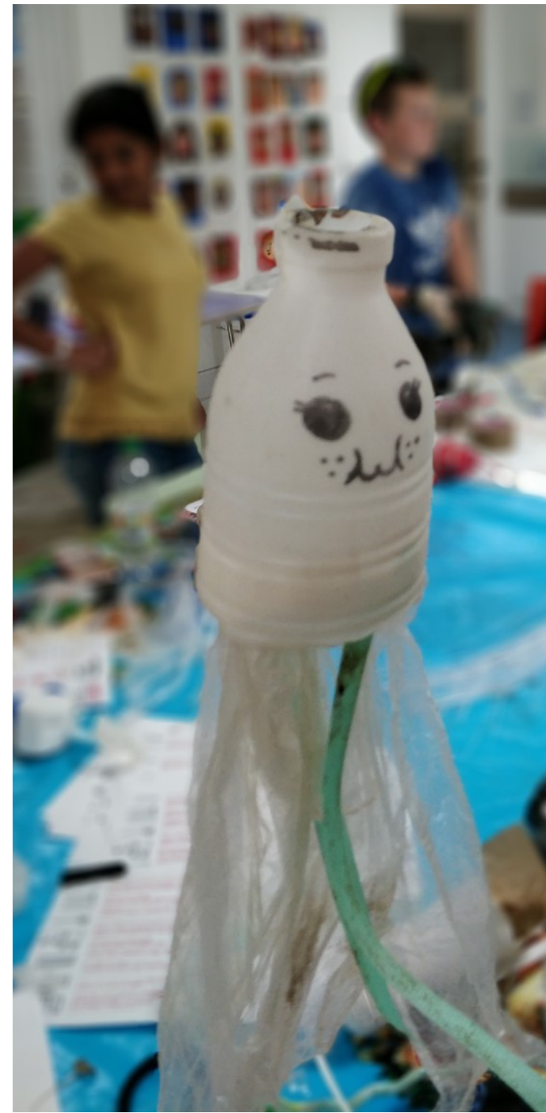
Youth forum No Môr Plastics creation, National Museum Cardiff

No Môr Plastics 37 #NoMôrPlastics was a Museum Intervention project at National Museum Cardiff, led by our youth forum. They temporarily transformed the marine displays with beach rubbish and brought the topic of plastic pollution into the Museum. This intervention enabled the young people to temporarily take control of the curatorship of the galleries, as a form of museum activism. Over 4 to 6 months, the young people cleaned and sorted beach plastic, they ran activities for other groups of visitors, from family workshops to targeted workshops with communities. They planned the interpretation and installation of the intervention in the dioramas, with support from natural history conservators. They then volunteered, and assisted in providing activities for visitors.