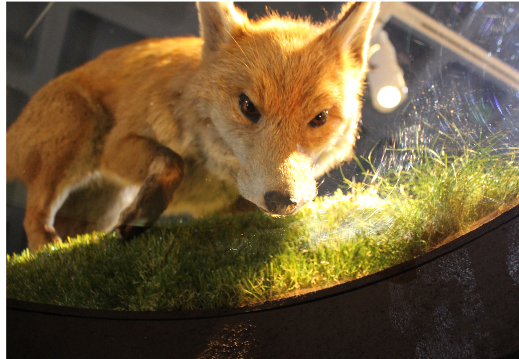
Fox peering down at visitors in the Wriggle Den, National Museum Cardiff.

What follows is a summary of the research collated and summarised, along with discussions and implications for natural history gallery developments.