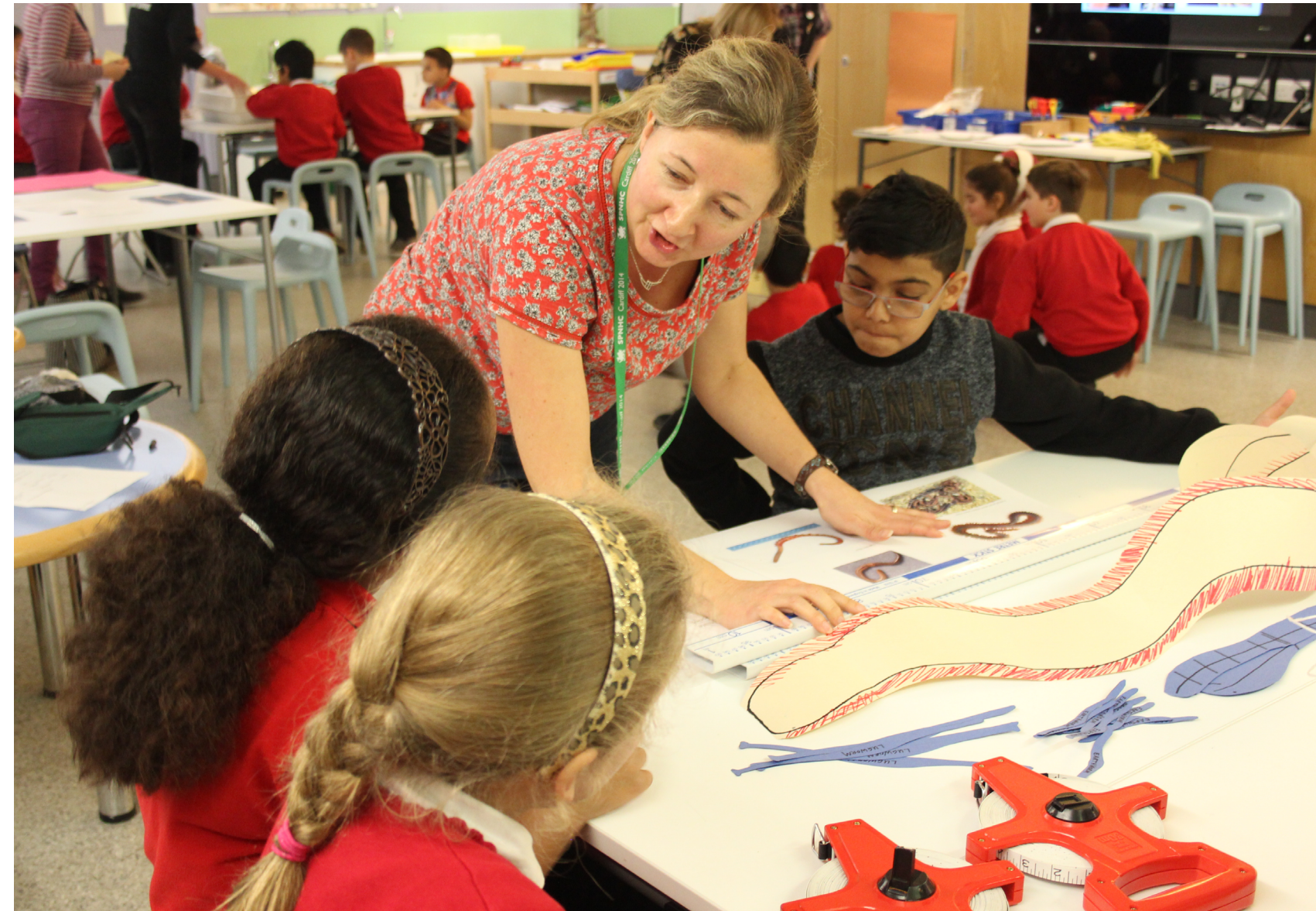
Children consultation for Wriggle exhibition, National Museum Cardiff

In our group discussion, they all liked the fact the animals were looking at them in the Wriggloo.