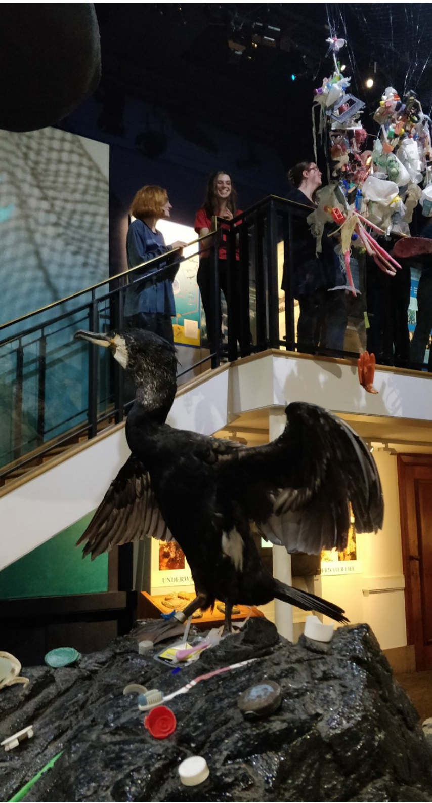
Youth forum No Môr Plastics display, National Museum Cardiff

Our most recent Natural History temporary exhibition ‘ Wriggle! The Wonderful World of Worms ’, involved children as consultants; to ensure the exhibition narrative was defined by them and for them as an audience.