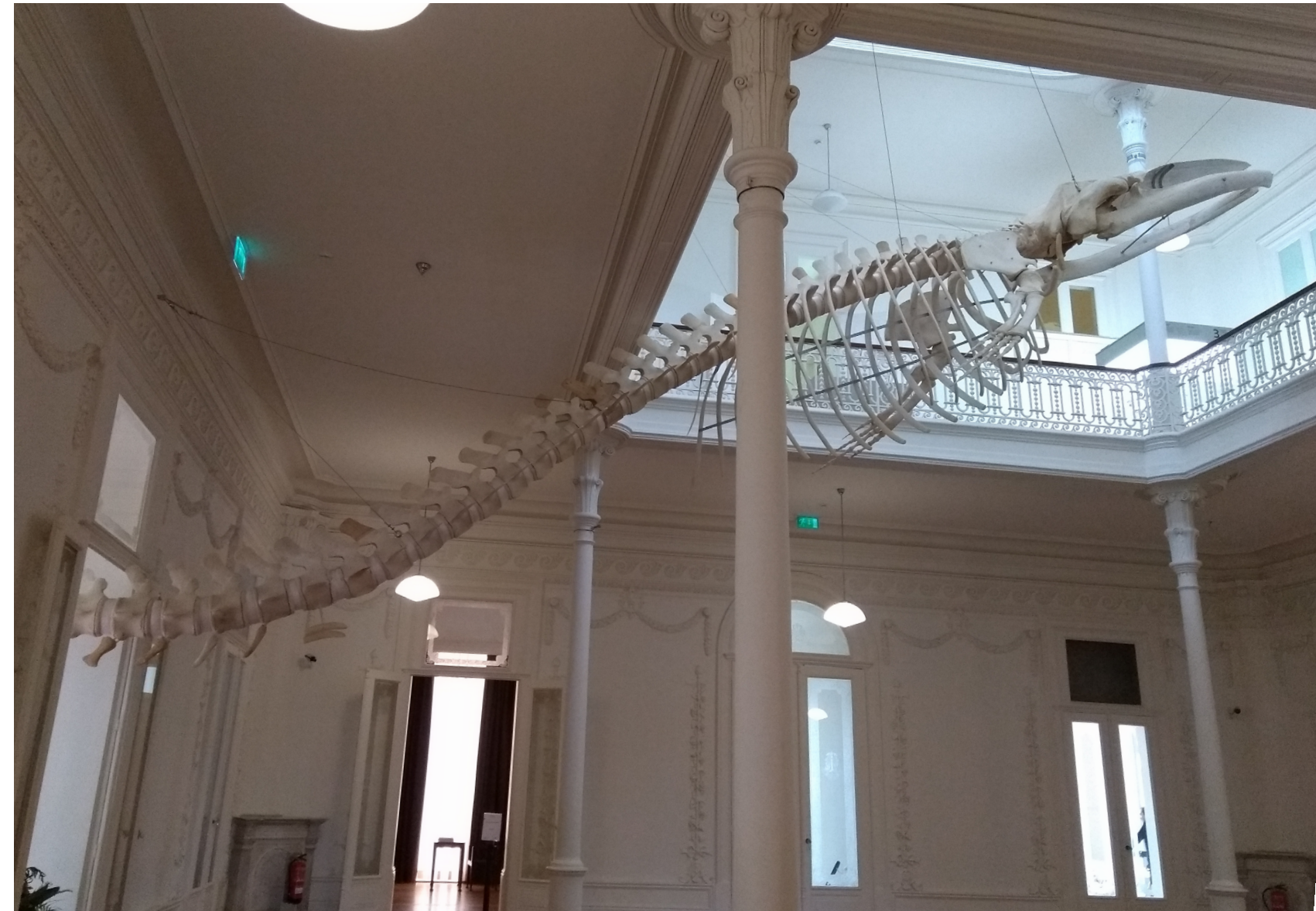
Blue whale skeleton, Porto Galeria da Biodiversidade

The interpretation of the whale is minimal. A large seat is placed on the 1st floor balcony, from which you can view the whale's skull in contrast with a shrew skeleton. On the seat are 3 buttons you can press. One provides you with the sound of a blue whale heartbeat, another the heartbeat of a shrew, and lastly a human heartbeat. No further interpretation is needed to connect yourself to the whale and shrew. The interpretation is simple, but effective. And, if needed, more information is provided in a short text on the chair's back.