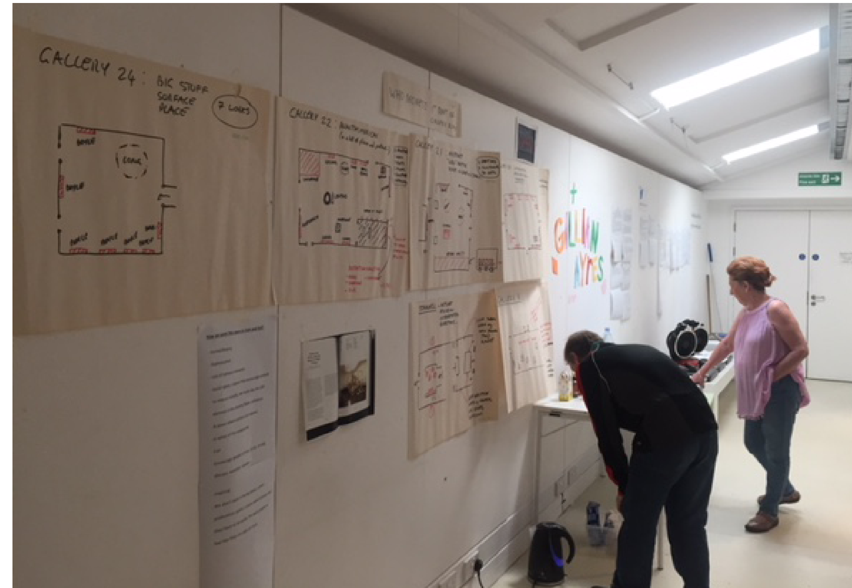
Volunteers from the Wallich developing their storyline, National Museum Cardiff

Who Decides? was an Art exhibition curated by volunteers from the Wallich, a charity which supports people who have experienced homelessness. Its aim was to open up decision-making about what we exhibit to communities, and to create a more democratic and accountable museum.