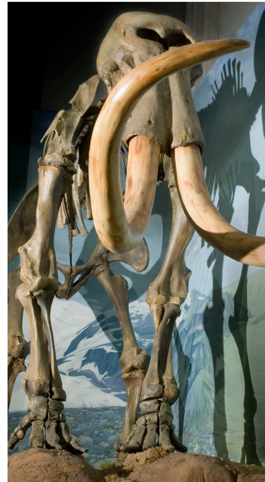
Mammoth, National Museum Cardiff.