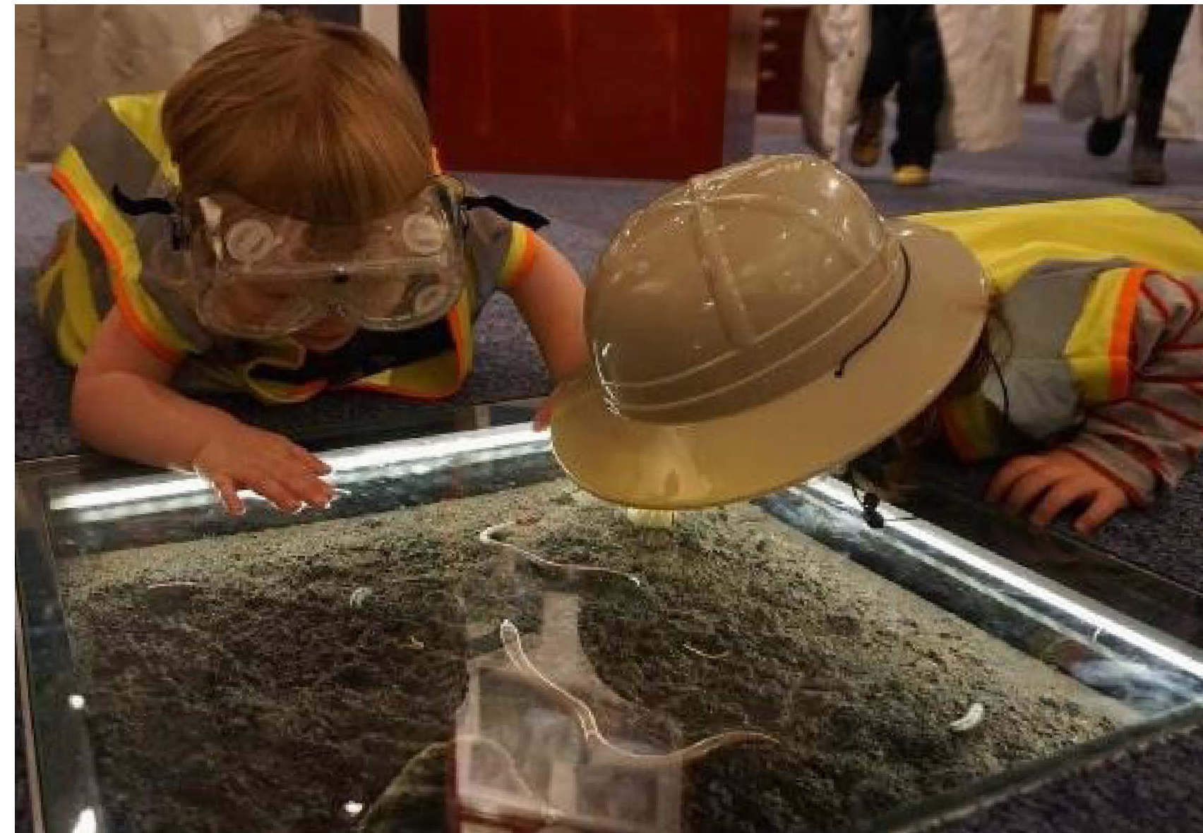
Toddlers exploring floor dioramas, National Museum Cardiff.

The role of the adult is important in scaffolding and facilitating the visit (Diamond, 1986) 25 . Through our observations of visitors we have noted adults guiding children through exhibits, answering questions, and posing questions. It's important that adults feel like they have the resources available to them to answer questions, or know what they are doing. Exhibits that guide adults as well as children can be particularly effective. Diana Kaiser's MSc project at National Museum Cardiff used different types of labels to observe how long families would spend 'engaging' with the same exhibit. The labels that encouraged an element of interactivity, or things for the whole family to do, saw a statistically significant increase in time spent with that display, compared with the 'control' didactic, information-giving label.