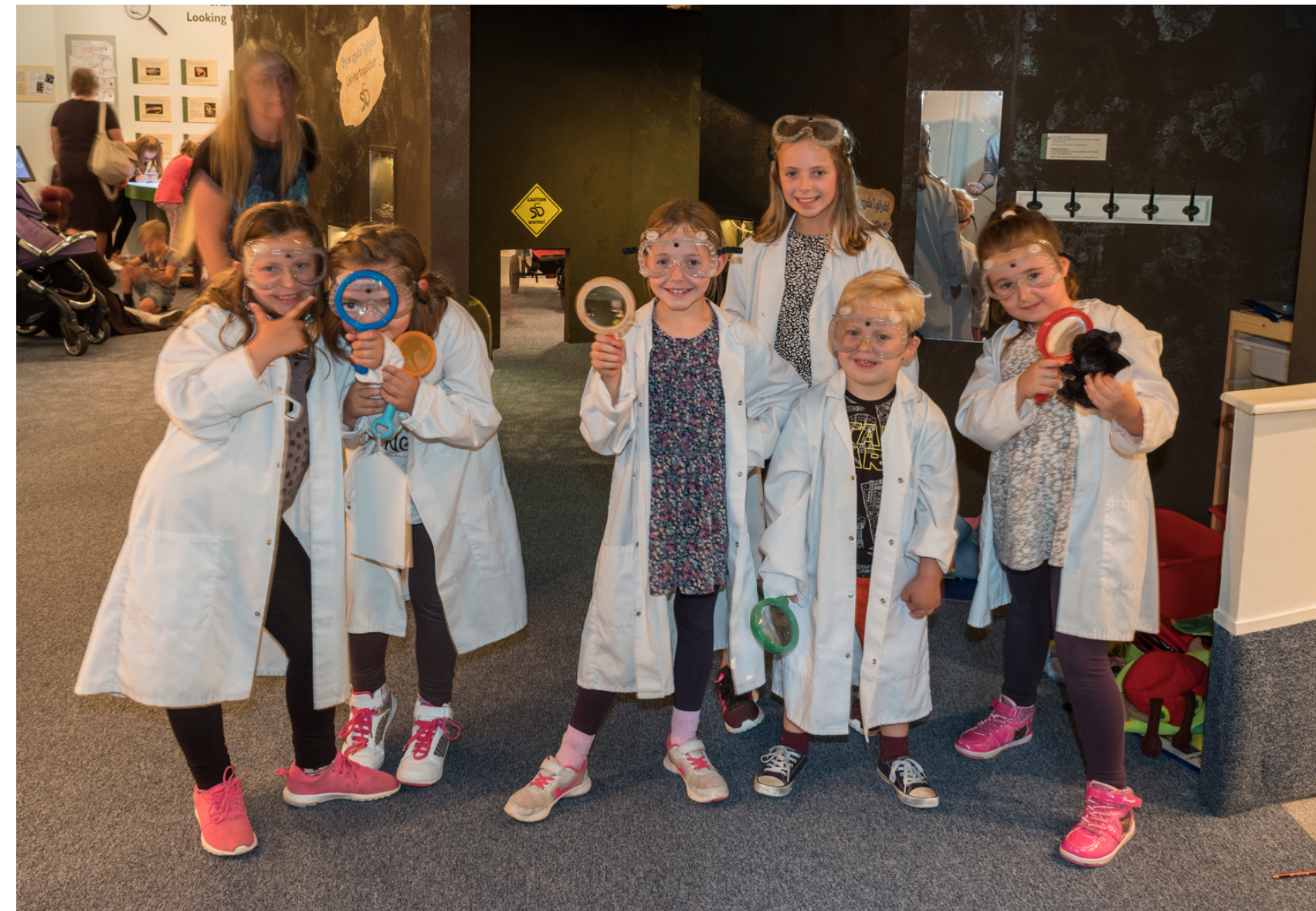
Children in front of the Wriggloo. National Museum Cardiff

At this point it was decided to include a group of 7-11 year olds from a local school in helping plan the exhibition. They became our 'consultants' and the resulting exhibition was a mixture of their words and ideas, combined with ours.