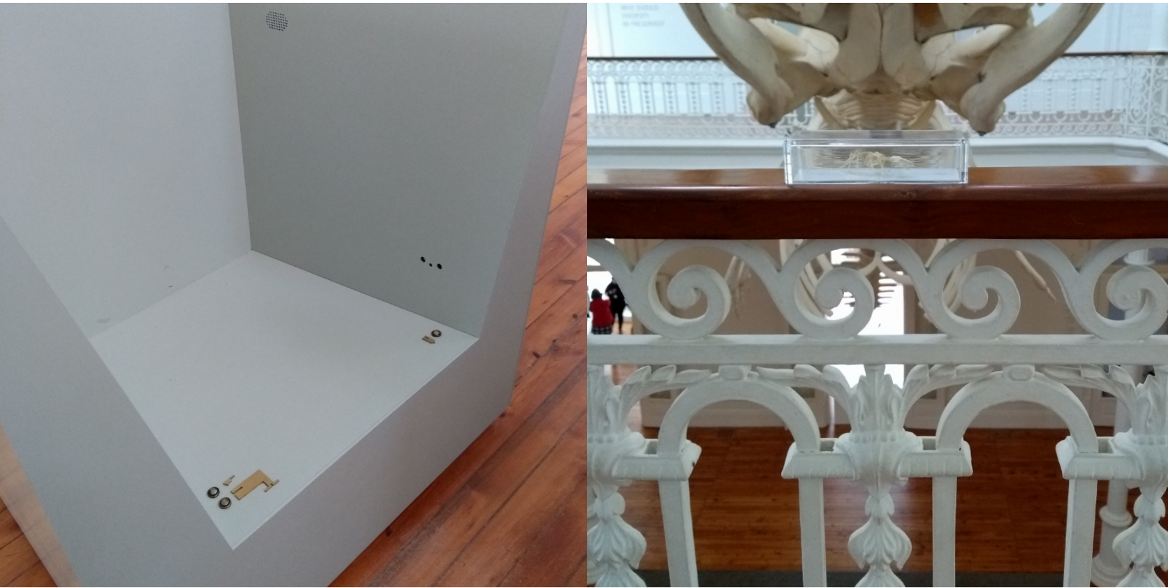
Chair and shrew in front of whale skeleton, Porto Galeria da Biodiversidade