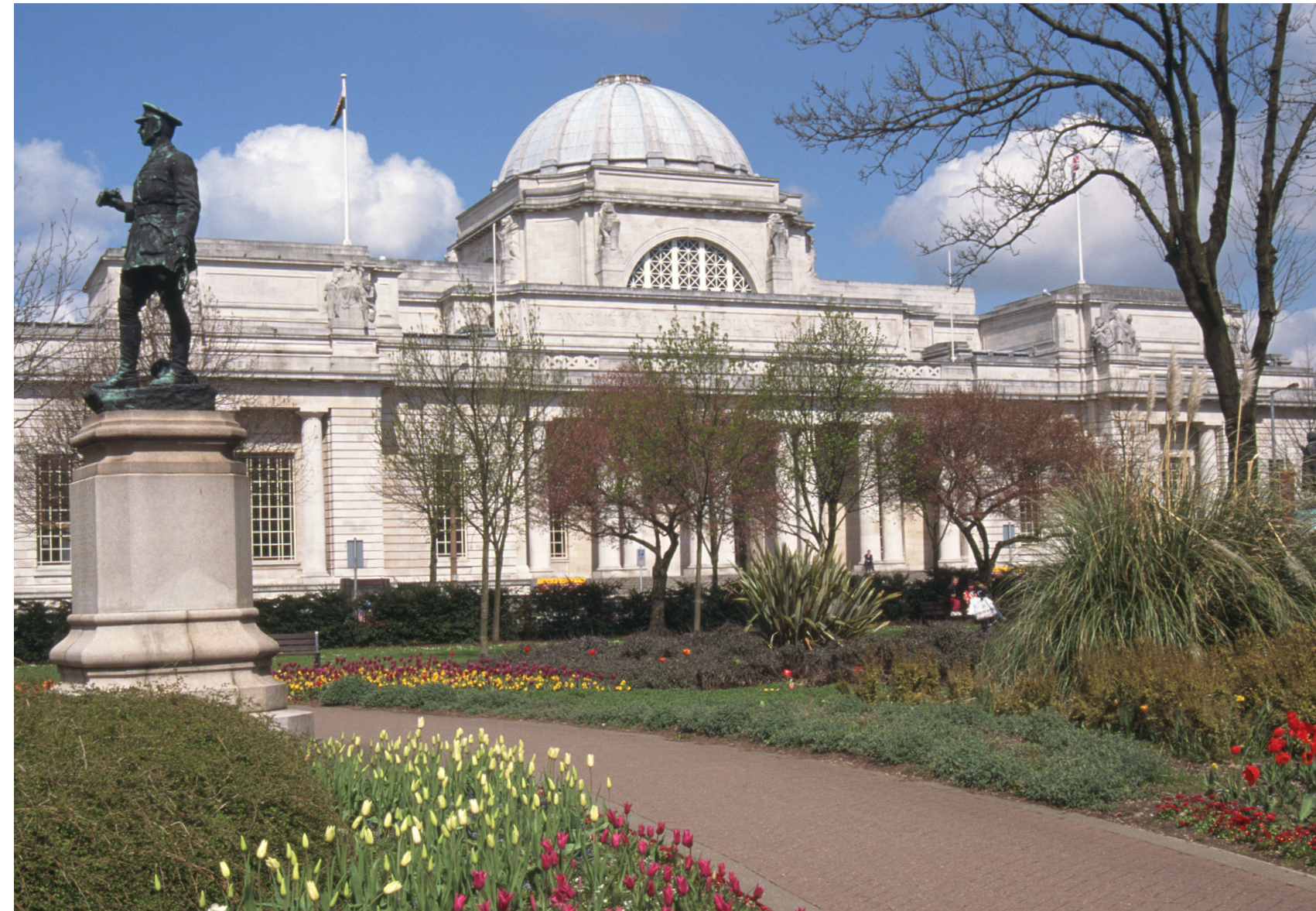
National Museum Cardiff.