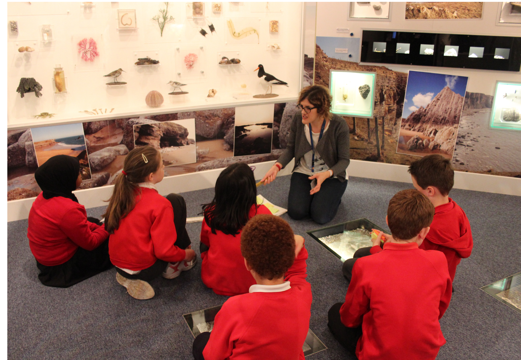
Children consultation for Wriggle exhibition, National Museum Cardiff

The children were also involved further in the process to check the interpretive text and feedback on the graphic design. And finally, they came in to evaluate the exhibition within a focus group.