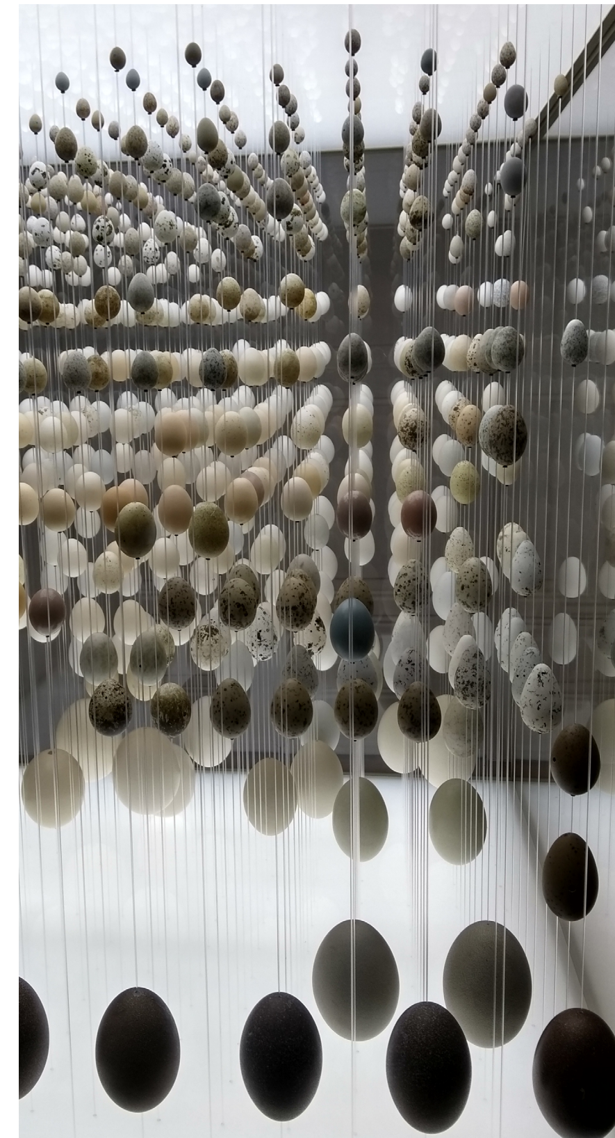
Hypercubic display of eggs, Porto Galeria da Biodiversidade

Through visiting the Museum, I began to understand the intention behind the exhibits. The architecture and story of the building and the people that lived there were as much a part of the narrative as the objects and interactives on display.